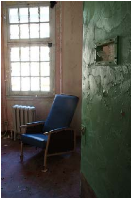
“Carrying the Cross”