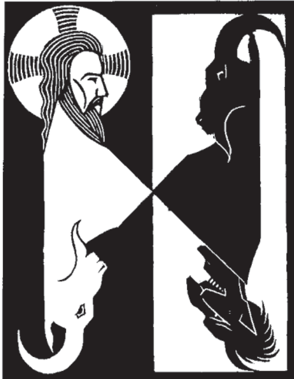
“The Scapegoat” by M.C. Escher