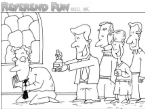
CONGRATULATIONS ... YOU HAVE BEEN VOTED THE MOST VALUABLE PRAYER