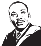
Martin Luther King, Jr. Day